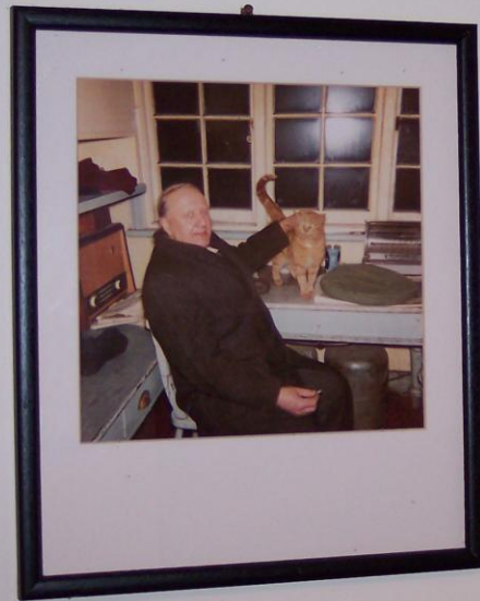
Paxford and Ginger